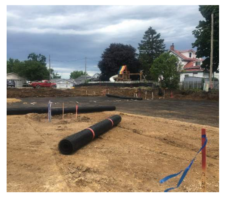
A geogrid materials is laid underneath the parking lot base courses to help secure the soil beneath the new parking lot!