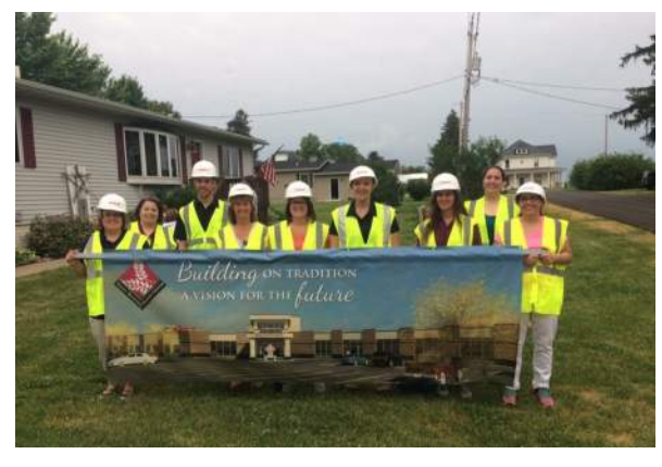
Grant Regional representing at the Mt. Hope Dairy Days parade!