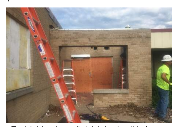
The Administration vestibule is being demolished to prepare for the new Clinic / Med Surge addition.