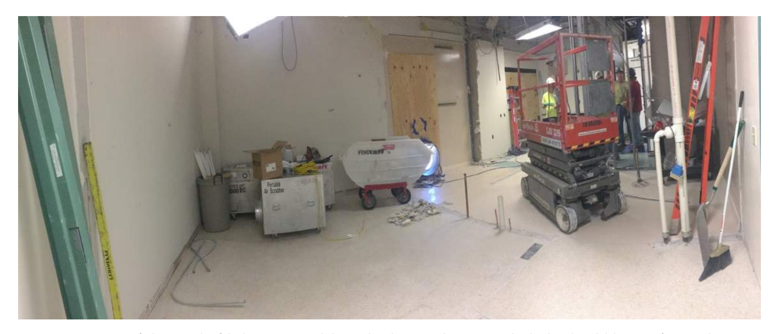
A panoramic view of what is inside of the barriers pictured above. The white carts shown are used to haul trash and debris out of GRHC. They are covered with a cleaned cloth which keeps the dust inside of the cart in order to be transported outside to be disposed of.