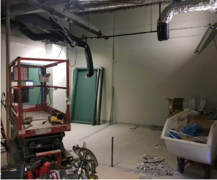
Interior demolition in the Emergency Department. This is the view when entering the barriers. The lines on the floor show where walls used to sit.