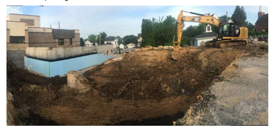
Excavation for the footings at the Ambulance Garage area shown above, and the footings can be seen to the right.