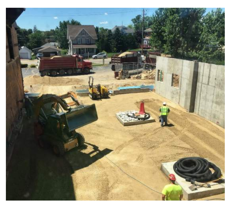
The ground below the new Education area being prepped before the floor is poured and the steel structure is installed.