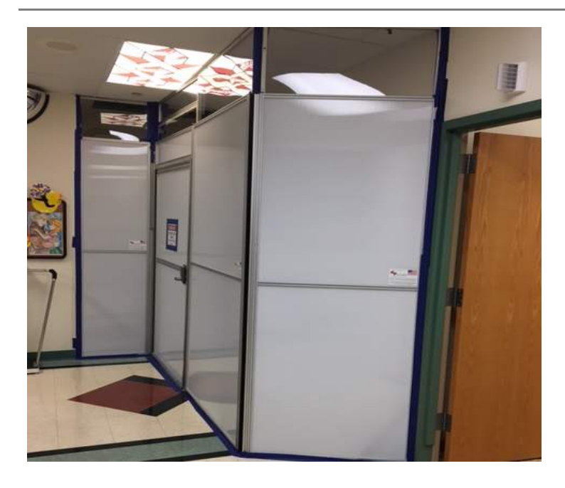
Interior demolition is underway in the Emergency Department. These barriers help keep the inside of Grant Regional Health Center clean and safe. They will be used throughout the project.