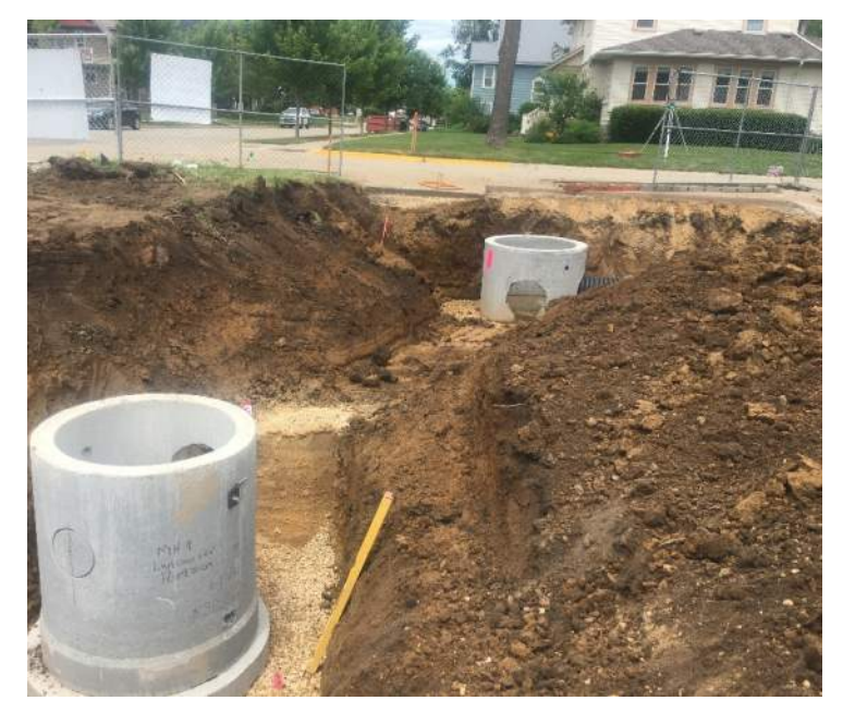
Manholes are being installed on the North side of the new parking lot. These help control storm water runoff.