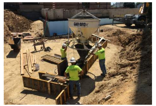
Footings are being formed and poured for the new Ambulance Garage.